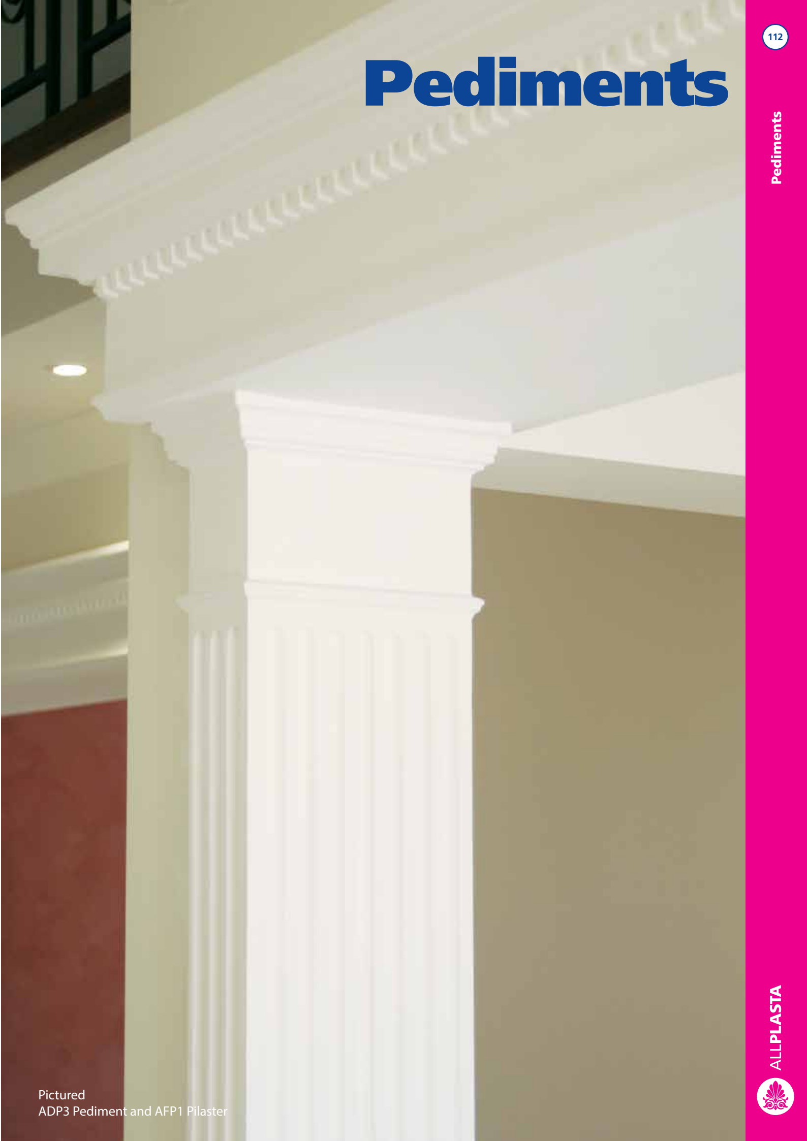
Pictured ADP3 Pediment and AFP1 Pilaster